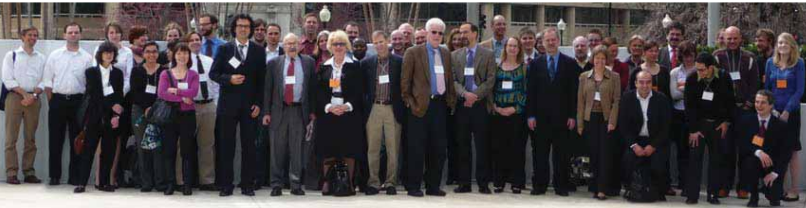
Conference attendees enjoy the spring sunshine during a conference break